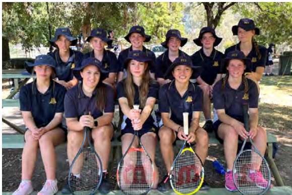
Intermediate Girls Tennis Champs