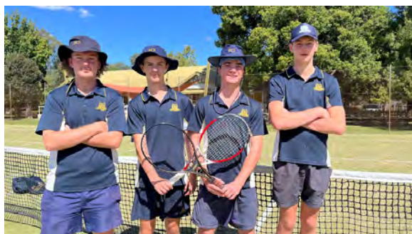
Intermediate Boys Tennis Champs