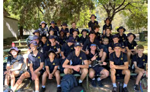
Year 7-10 Boys Tennis