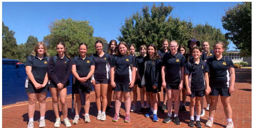
Year 8 Girls Volleyball