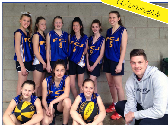
Yr 7 Girls