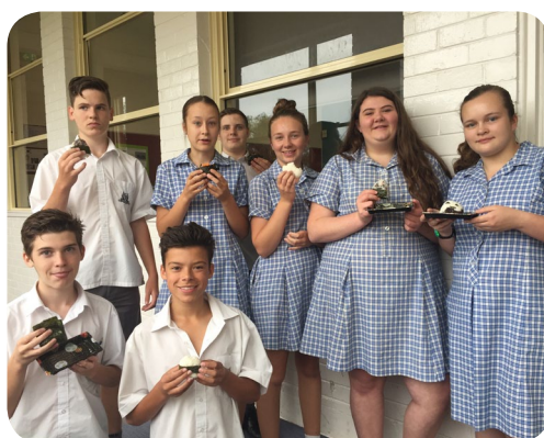
Table For Two partner organizations will provide a donation for each posted onigiri photo to provide 5 school meals to children in need.

Onigiri (rice ball) is a traditional and healthy snack in Japan where it first started. Onigiri is featured to celebrate rice, one of the major Japanese agricultural products, and to showcase the Japanese tradition of making onigiri for others with love.